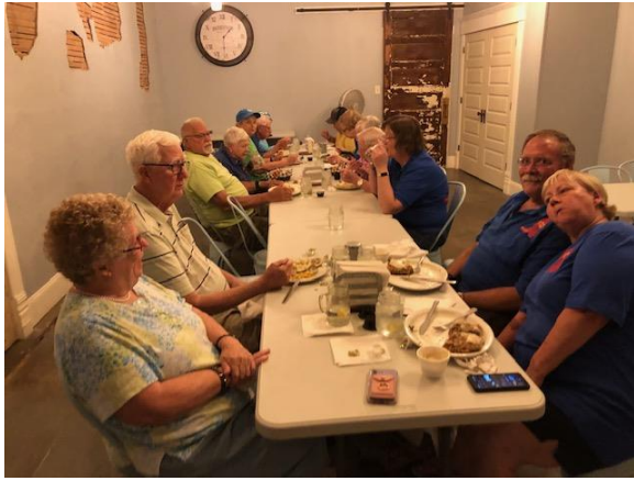
Dinner at the Farmhouse in Riley.

Everybody enjoyed the State rally in Hutchinson with good entertainment every night. We had a lot of good help with the Pancake feed with a good crowd attending. Thanks for the great help!! We had a lot of good compliments from the people attending. The Cowboy Sams group all went out to lunch with Texas attendees at the Dutch Kitchen and had a great time.