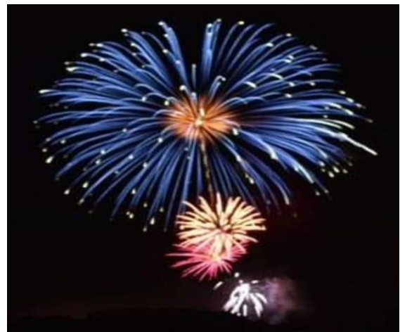
Fireworks at the Coffeyville Summer Celebration