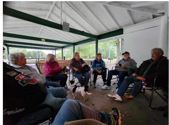
Playing games at Napawalla Park in Oxford

evening along with playing games and sitting by the fireplace.