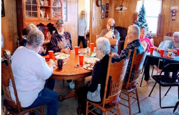
Annual Christmas meal with some of our past members

In December for our annual meeting, we met at a member's house and had our annual Christmas dinner since plans for our normal place got double booked. It all worked out and we had a great time, plenty of good food and lots of visiting.