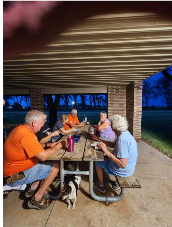
Playing games at Anthony Municipal Lake with Ninnescah Good Sams and Sonic Sams

In August we camped at Anthony Municipal Lake and were joined by some Ninnescah Good Sams, and some Sonic Sams. We enjoyed a potluck with good food with everyone on Friday night. Some of us got together and drove down to Wakita, Oklahoma to check out the Twister Museum in the town where the movie, "Twister", was filmed. Then we got back to our campers just in time before some high winds and a downpour started.