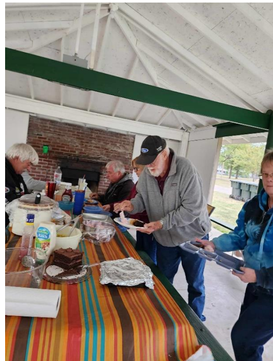
Potluck meal at Napawalla Park in Oxford