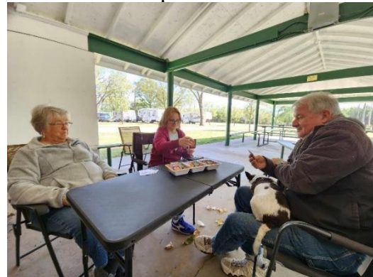
Playing games at Napawalla Park in Oxford