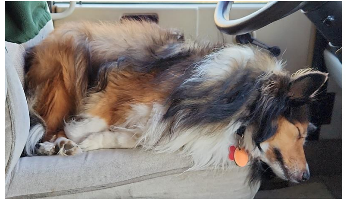
Exhausted after the long drive to the Kansas Rally