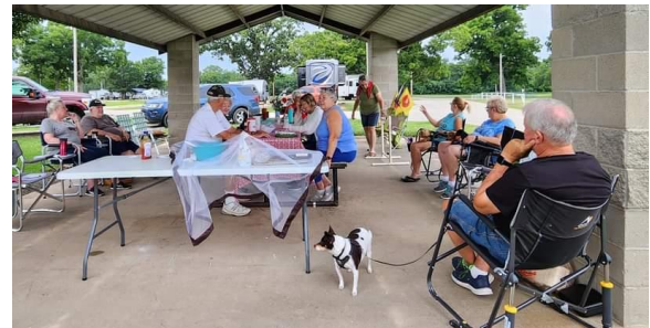
Sitting around visiting in Coffeyville with Ninnescah Good Sams and Wichita Good Sams