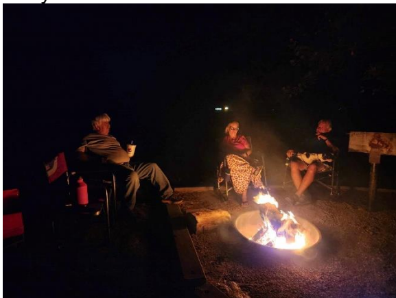
Sitting around the fire at Sarge Creek Cove

In September we got together at Sarge Creek, Kaw Lake in Oklahoma. We didn't have very many members then but we all had a good time playing games and sharing meals. A few of our members attended the Kansas State Rally.