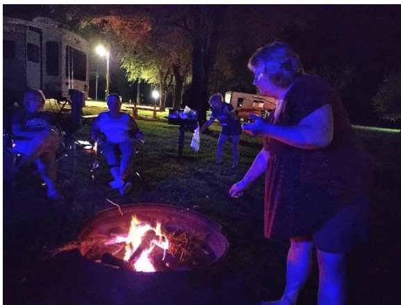
Sitting around the fire at Anthony Municipal Lake with Ninnescah Good Sams and S'Mores