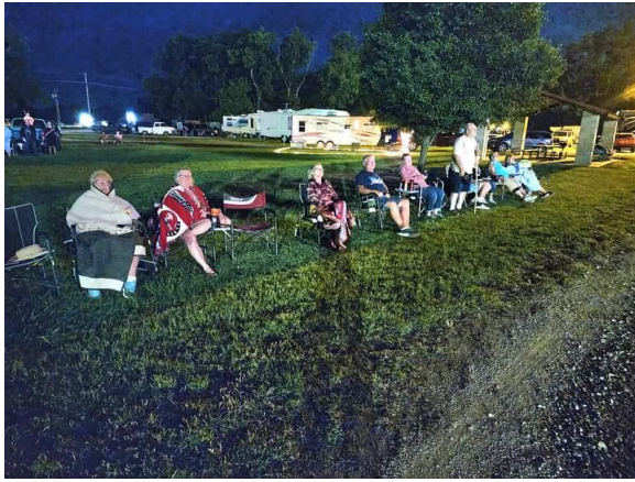
Watching the fireworks at the Coffeyville Summer Celebration with Ninnescah Good Sams and Wichita Good Sams

In August we camped at Anthony Municipal Lake and were joined by some Ninnescah Good Sams, and some Sonic Sams. We enjoyed a potluck with good food with everyone on Friday night. Some of us got together and drove down to Wakita, Oklahoma to check out the Twister Museum in the town where the movie, "Twister", was filmed. Then we got back to our campers just in time before some high winds and a downpour started.