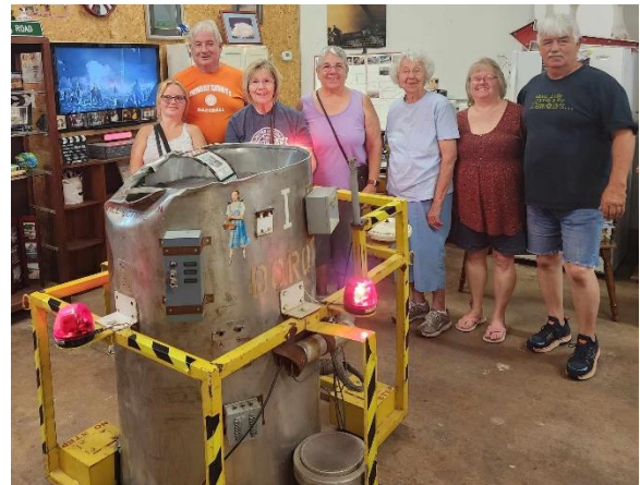
At the Twister Movie Museum in Wakita, Oklahoma with Ninnescah Good Sams and Sonic Sams