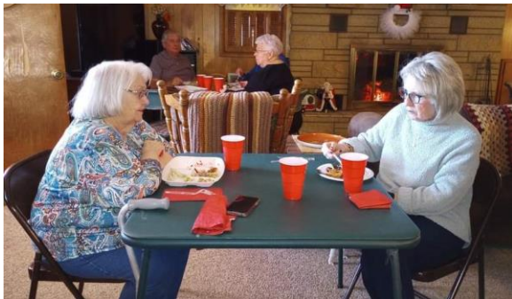
Annual Christmas meal with some of our past members