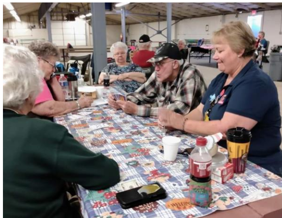
Playing games at Area IV Rally in Winfield.

At the end of April we joined other chapters from across the state at the Area IV Rally in Winfield for food, games, and entertainment.