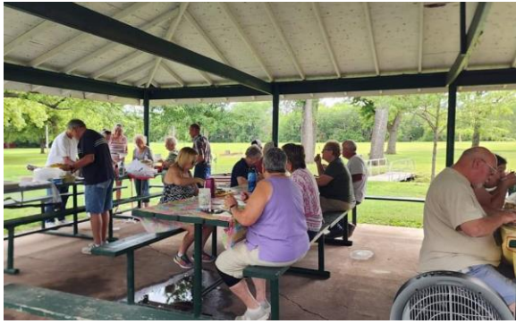
Eating potluck at Napawalla Park in Oxford with Wichita Good Sams and Ninnescah Good Sams.