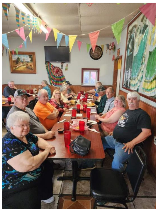
Eating at La Casita in Oxford with Wichita Good Sams and Ninnescah Good Sams.

The April meeting was at Oxford in La Casita a nice little Mexican place but excellent food there. We talked about the Area 4 Rally coming up later in April and all the plans for it. Enjoyed visiting and had many laughs too.