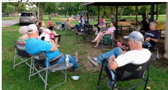
Visiting at Napawalla Park in Oxford with Wichita Good Sams and Ninnescah Good Sams.

May was our first chapter campout for the year at Napawalla Park in Oxford. We played many card and board games. Friday afternoon we went to the little Mexican restaurant La Casita and enjoyed their food. Saturday, we had a potluck dinner. We have many great cooks in our group we don't go away hungry.