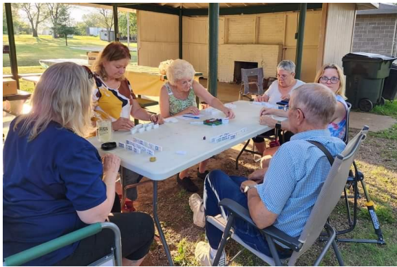
Playing games at Napawalla Park in Oxford with Wichita Good Sams and Ninnescah Good Sams.

Scheduled campouts for the rest of 2023 are: